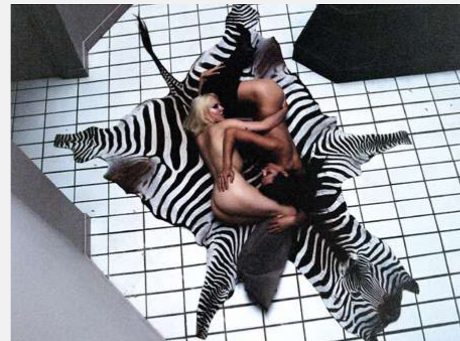
Purple Magazine Neva Wireko