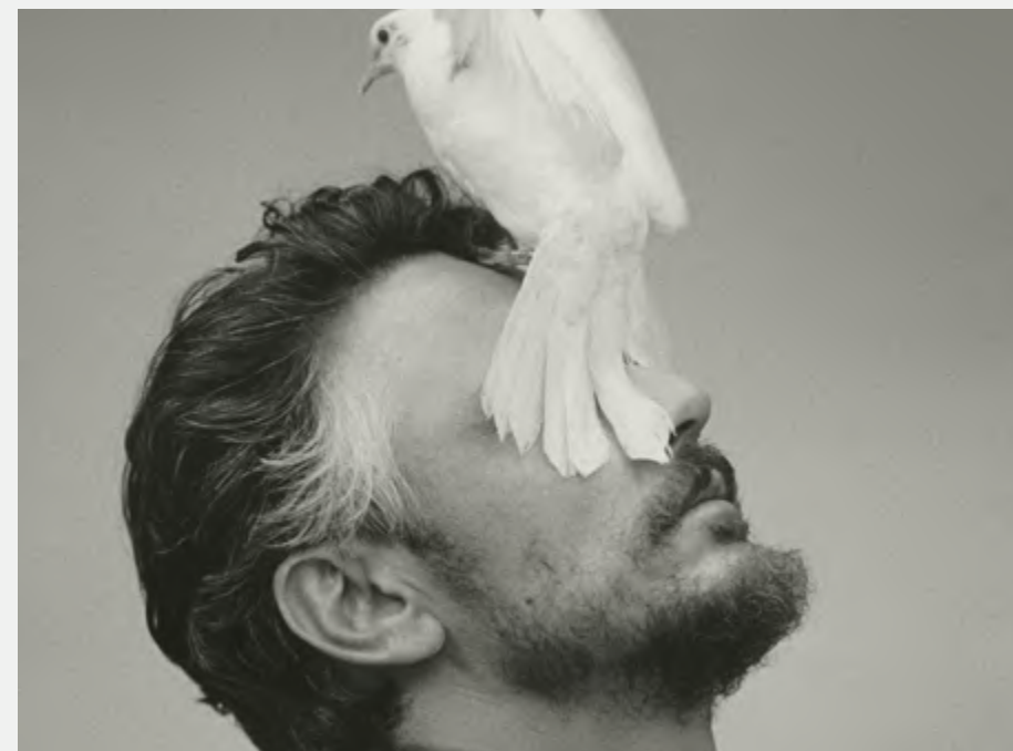
James Franco for Cap 74024