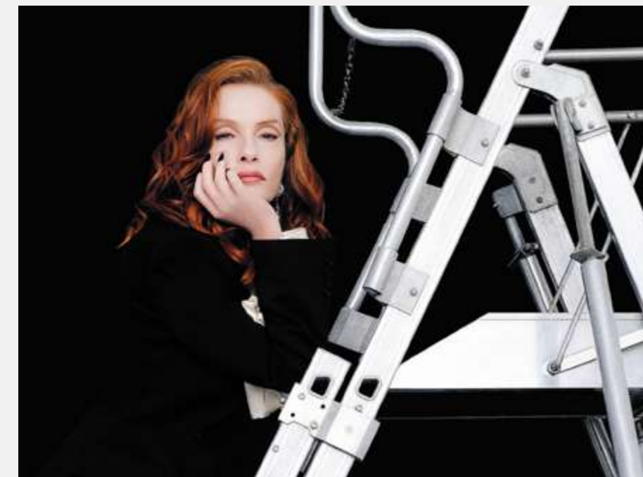
Isabelle Huppert for L'Officiel Italia