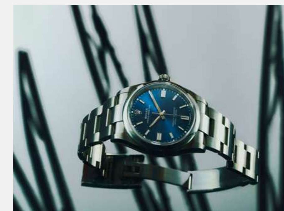
L'Atelier des Tocantes Mathilde Hiley