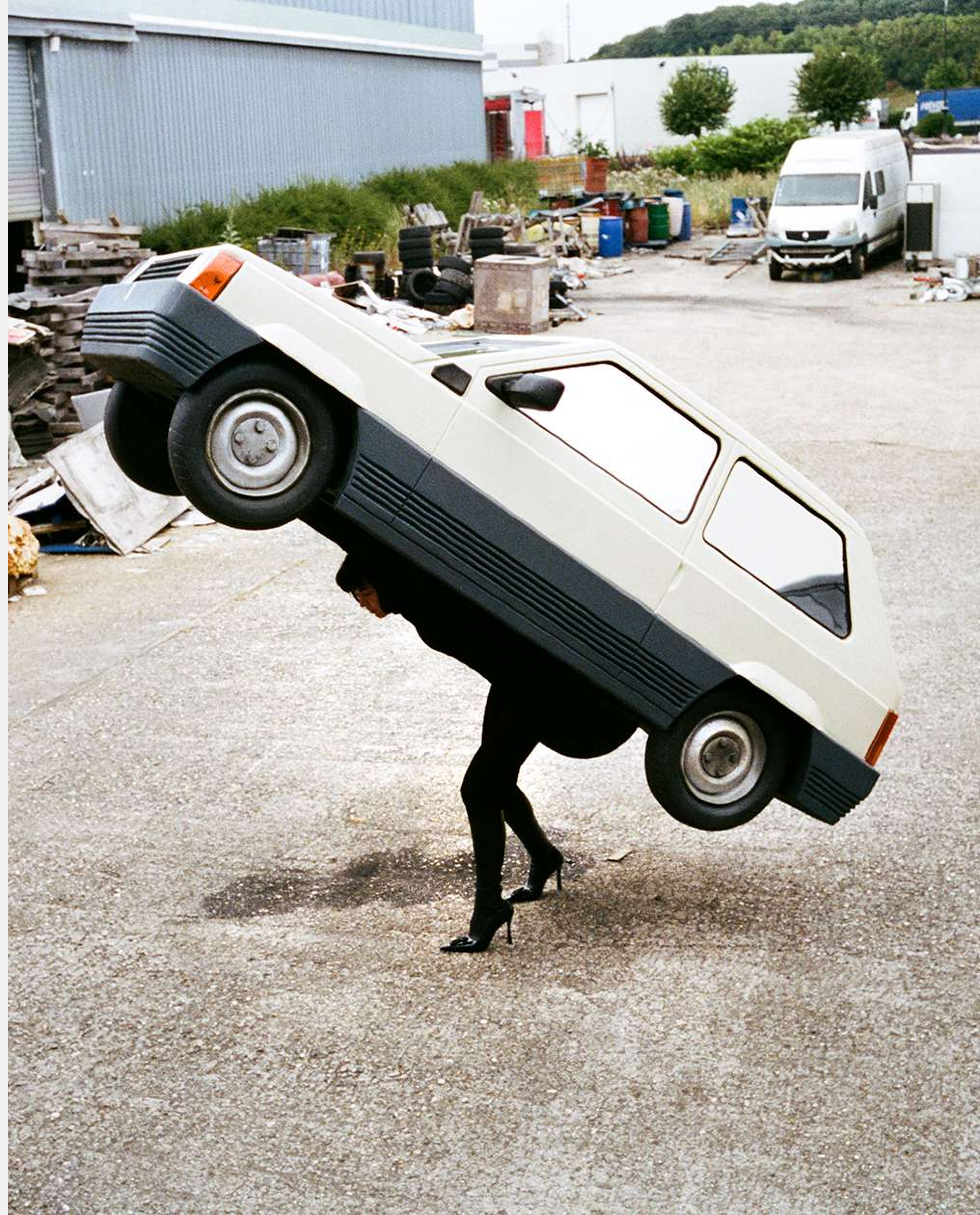
Vimala Pons for L'Espresso Magazine Maxime Ballesteros