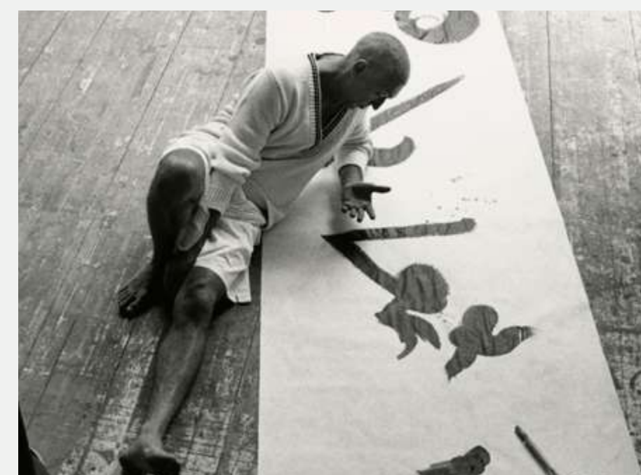
Vincent Cassel for Cap 74024 Dudi Hasson