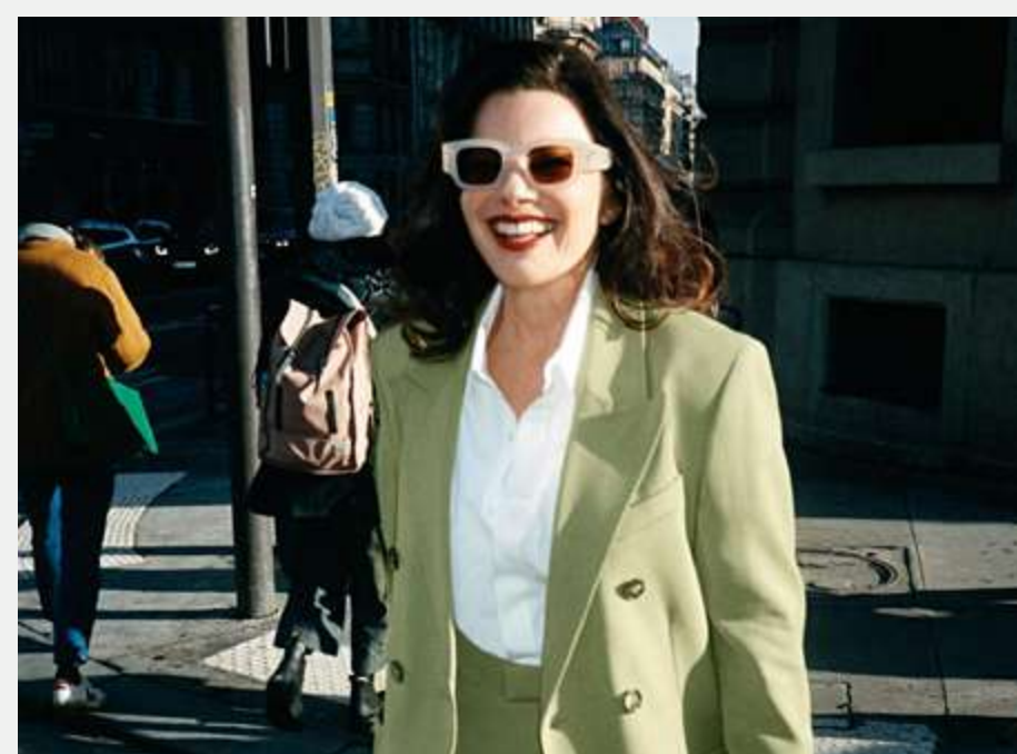
Fran Drescher for AMI Paris