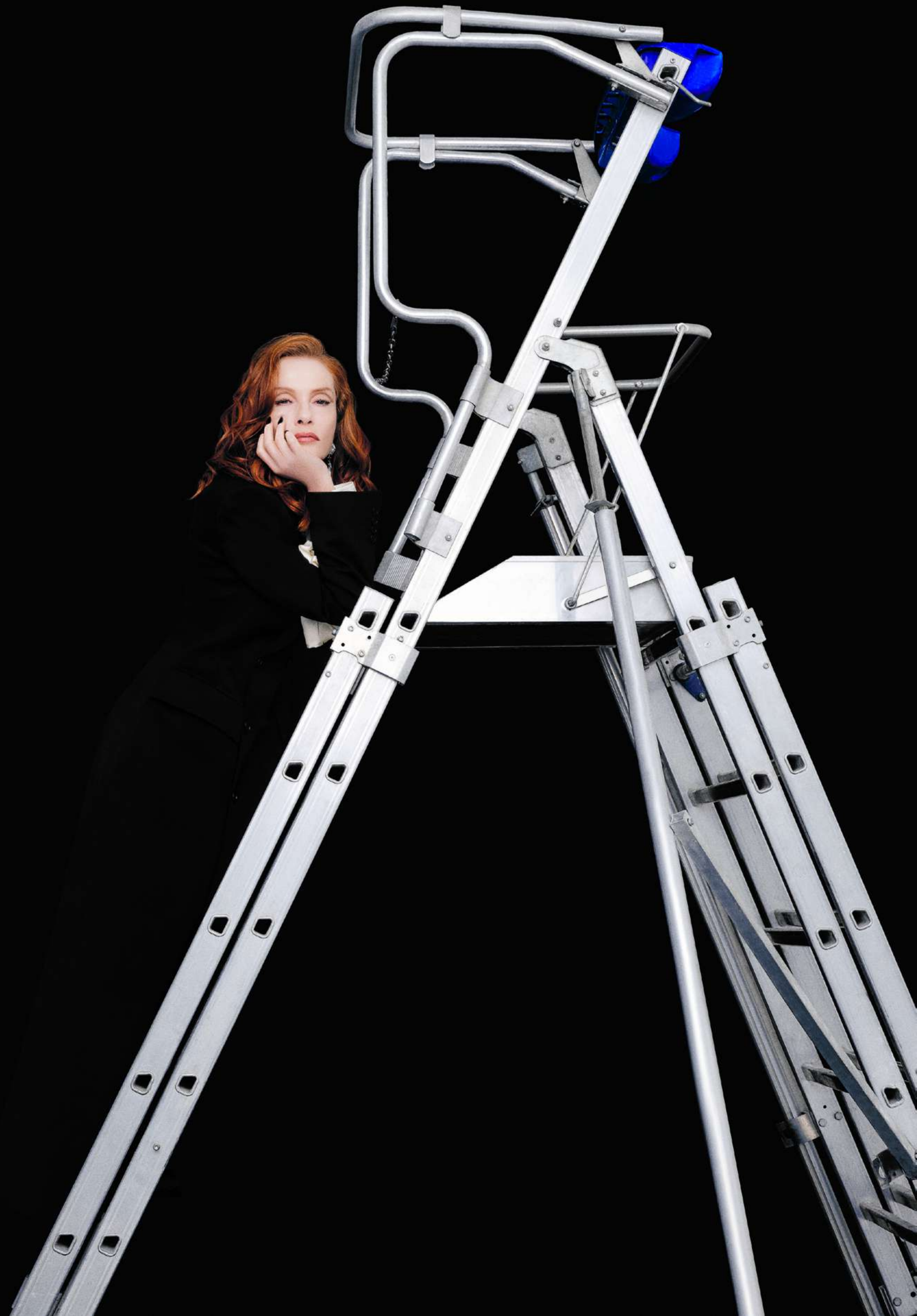
Isabelle Huppert for L'Officiel Italia