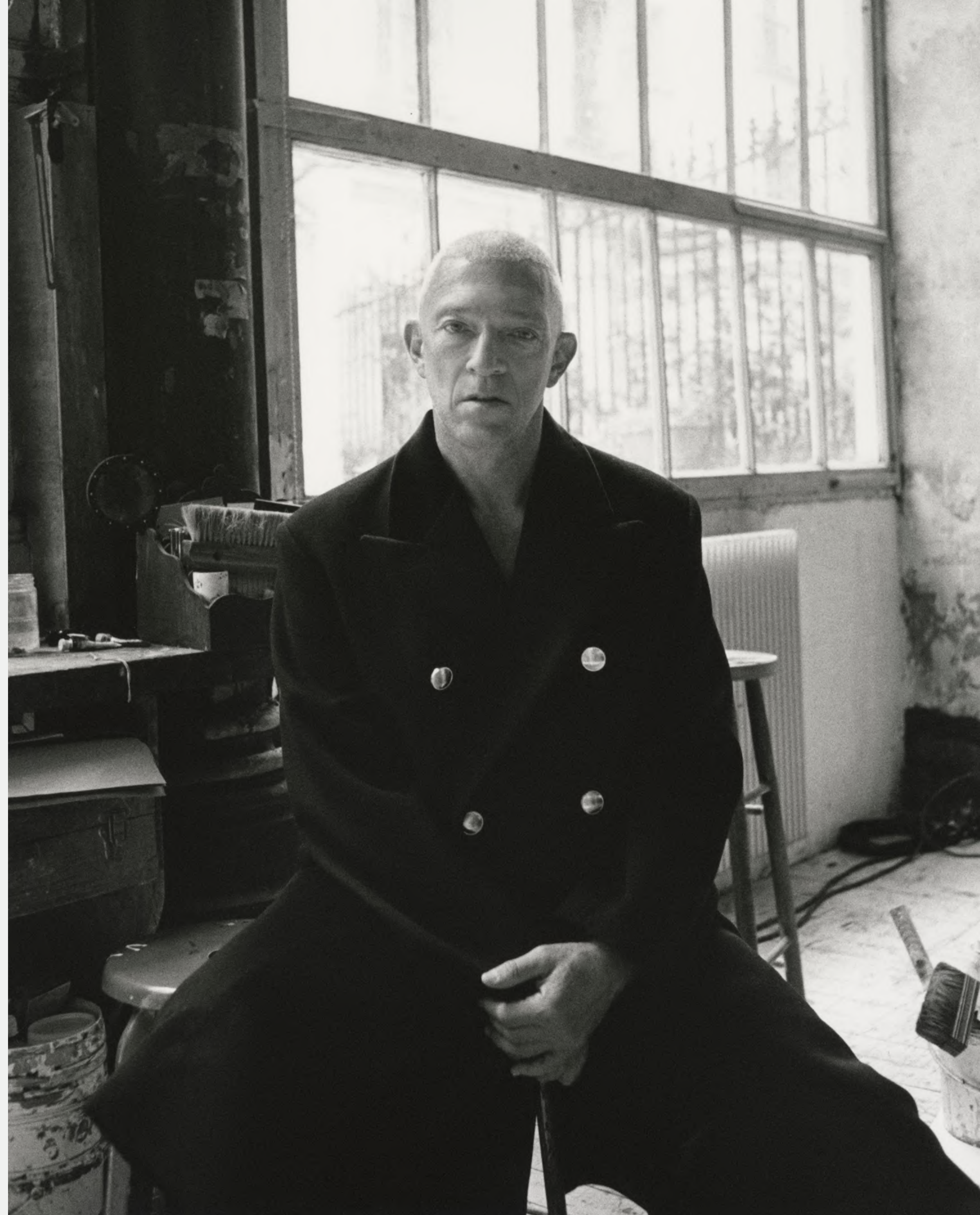
Vincent Cassel for Cap 74024 Dudi Hasson