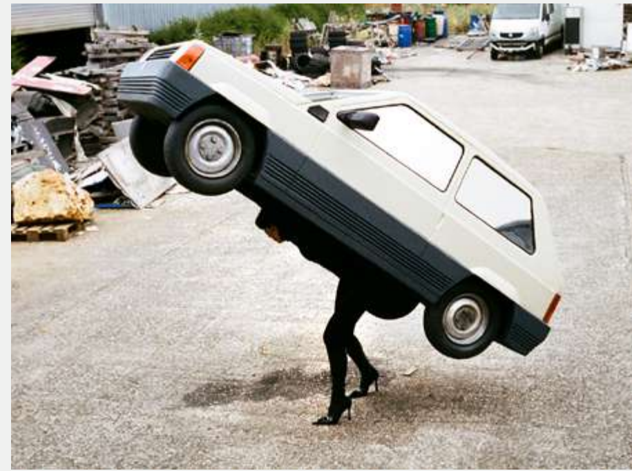
Vimala Pons for L'Espresso Magazine Maxime Ballesteros