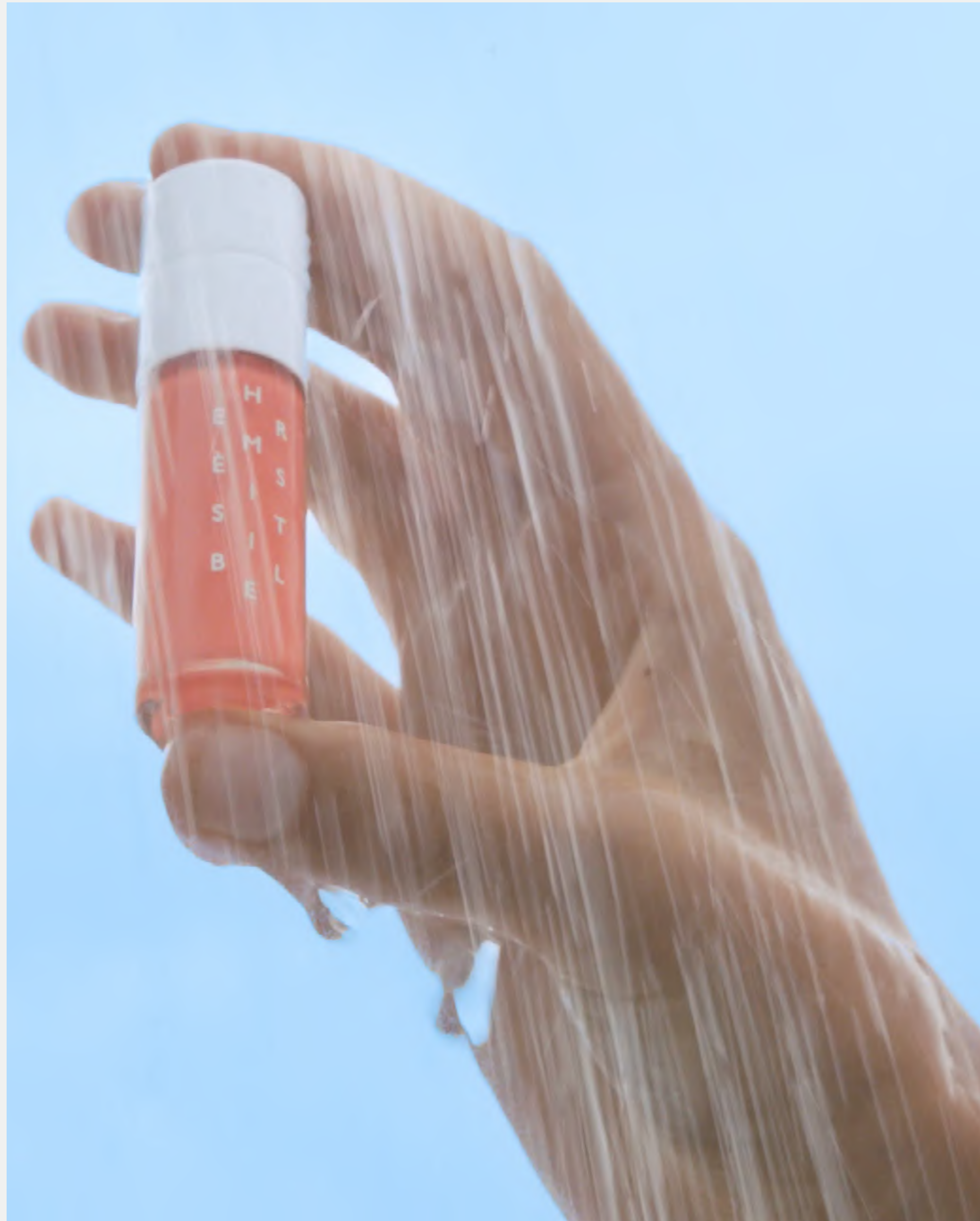
Link to the videos: Rose Pitaya , Rouge Amarelle , Corail Bigarade