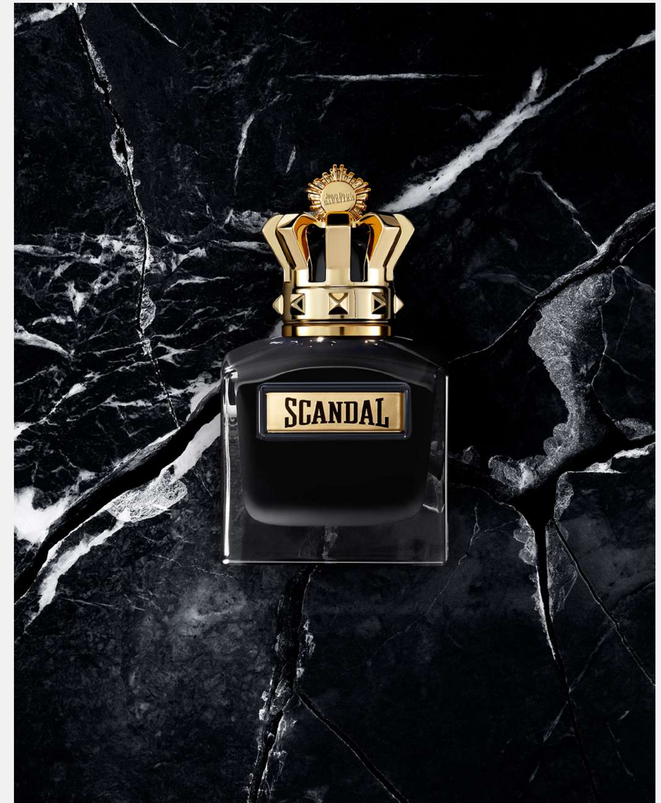
Jean Paul Gaultier