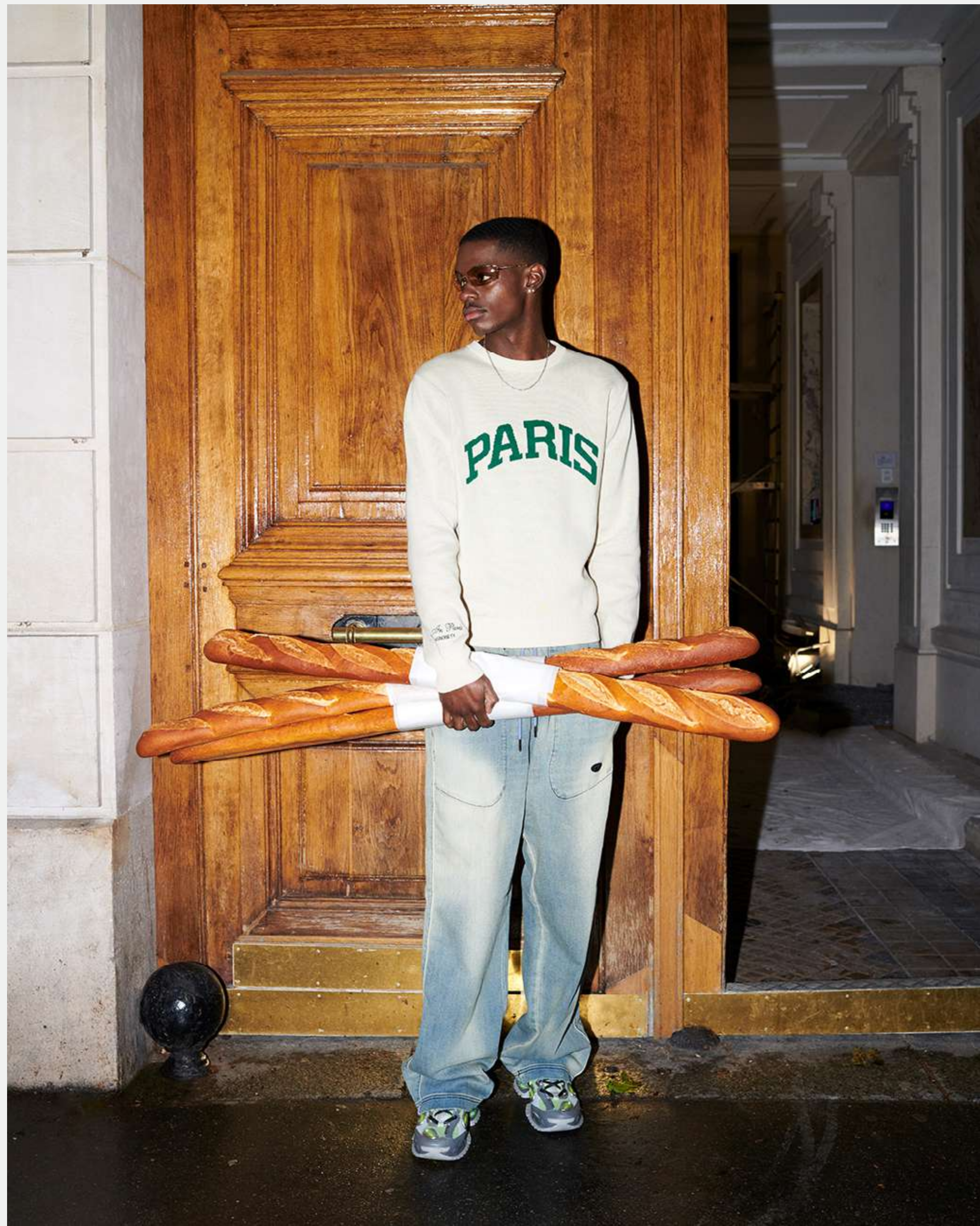
Highsnobiety Maxime Ballesteros