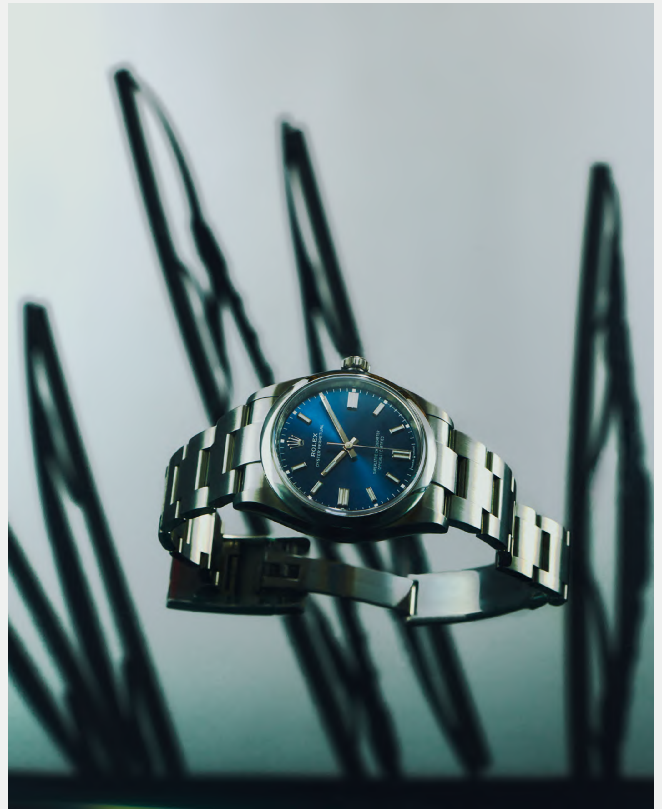
L'Atelier des Tocantes Mathilde Hiley