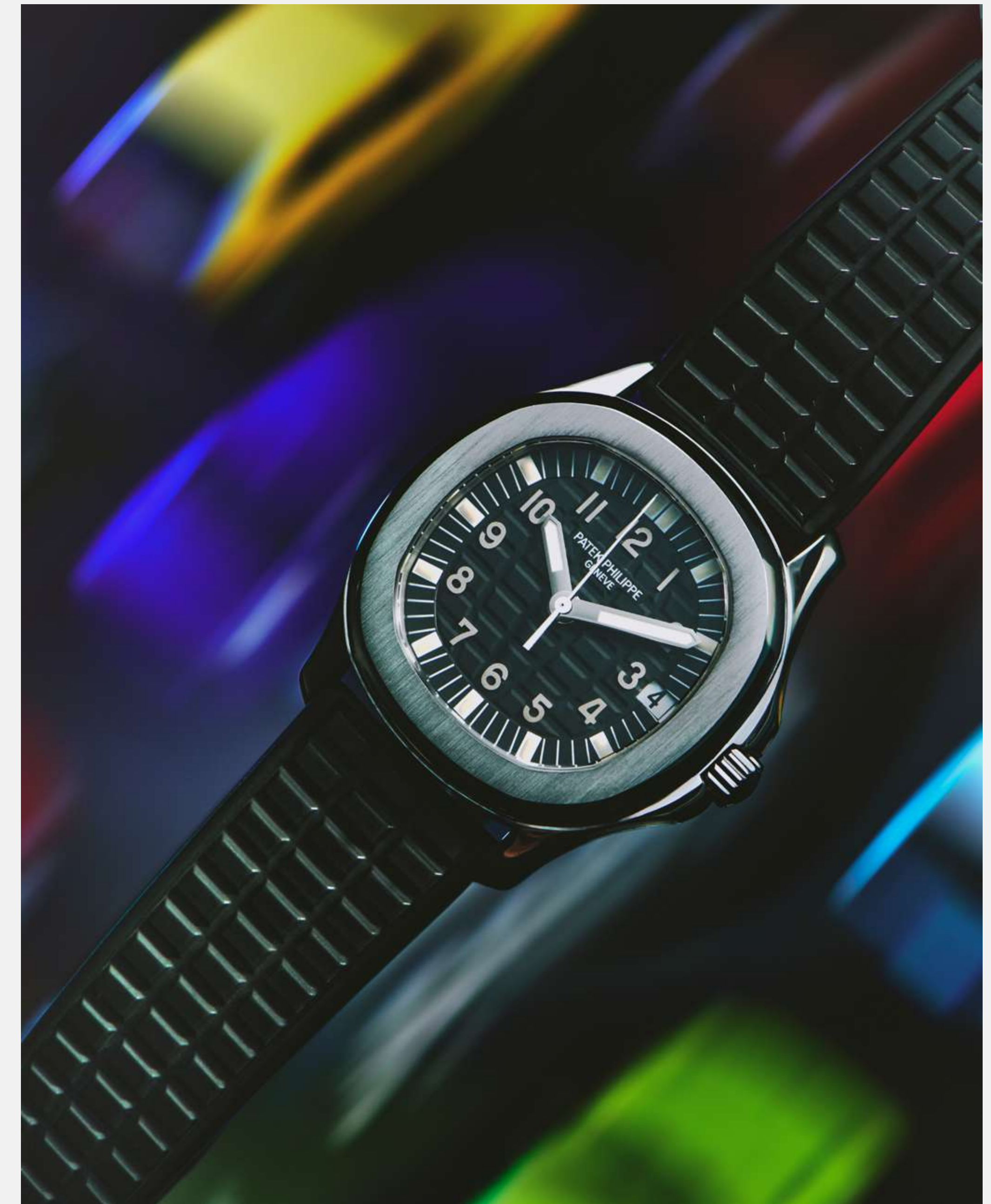
L'Atelier des Tocantes Mathilde Hiley