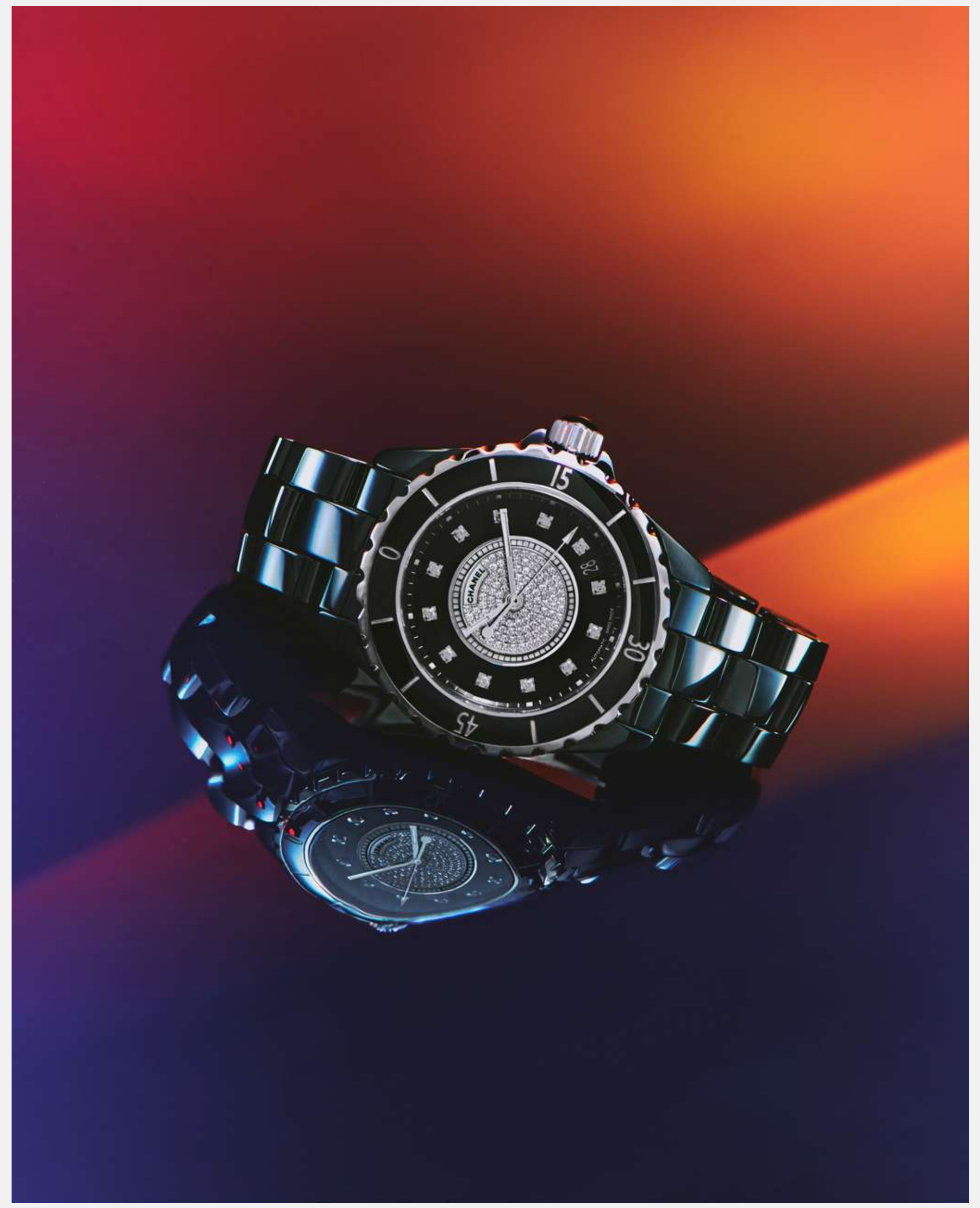
L'Atelier des Tocantes Mathilde Hiley