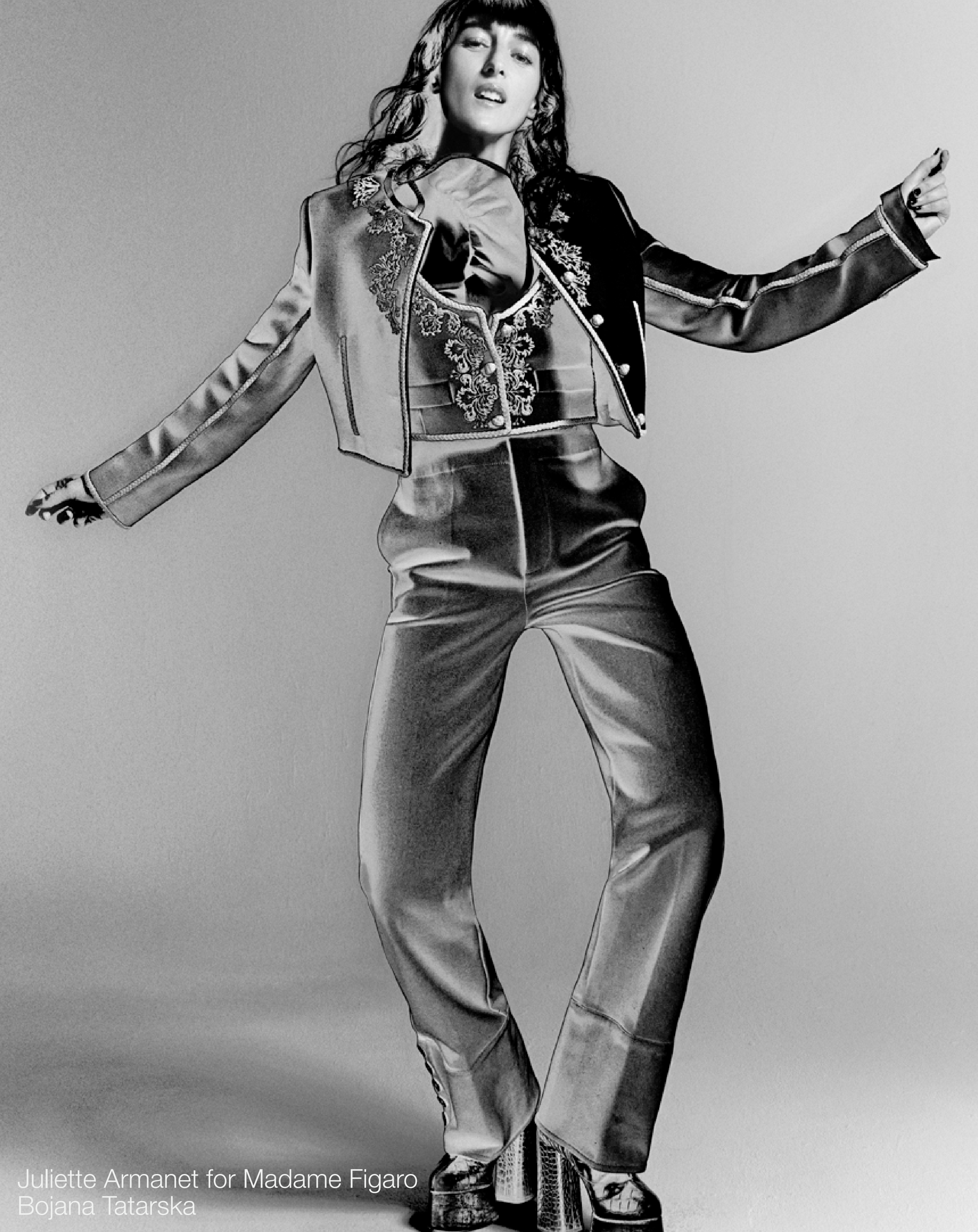
Juliette Armanet for Madame Figaro