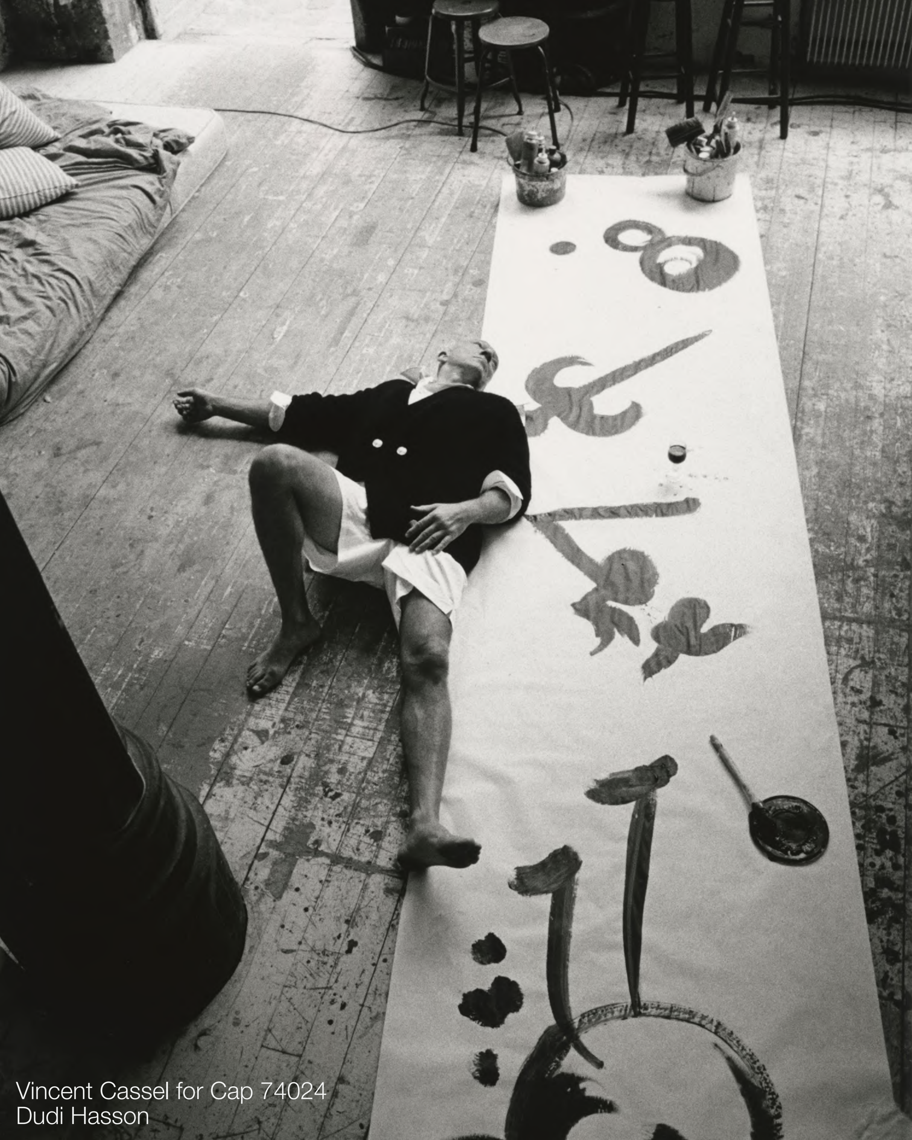
Vincent Cassel for Cap 74024 Dudi Hasson