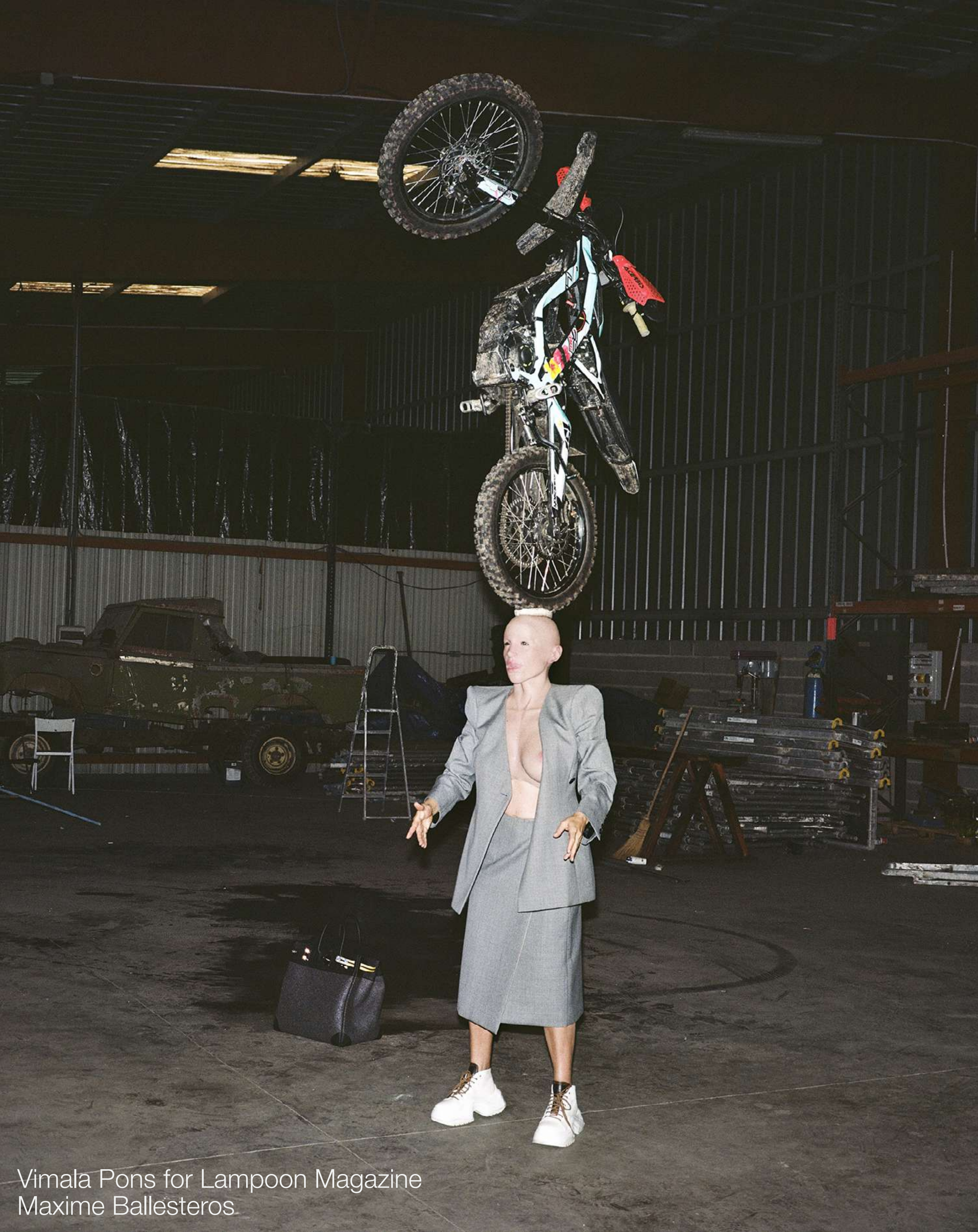
Vimala Pons for Lampoon Magazine Maxime Ballesteros